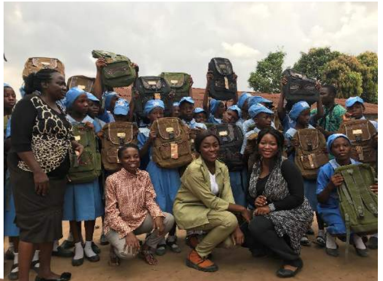
1 February 2019: with the recipients of school bags and supplies at the Oduduwa Junior Secondary School, Mushin