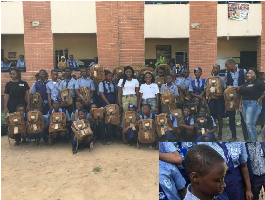
8 May 2019: with the recipients of school bags and supplies at the Oduduwa Senior Secondary School, Mushin