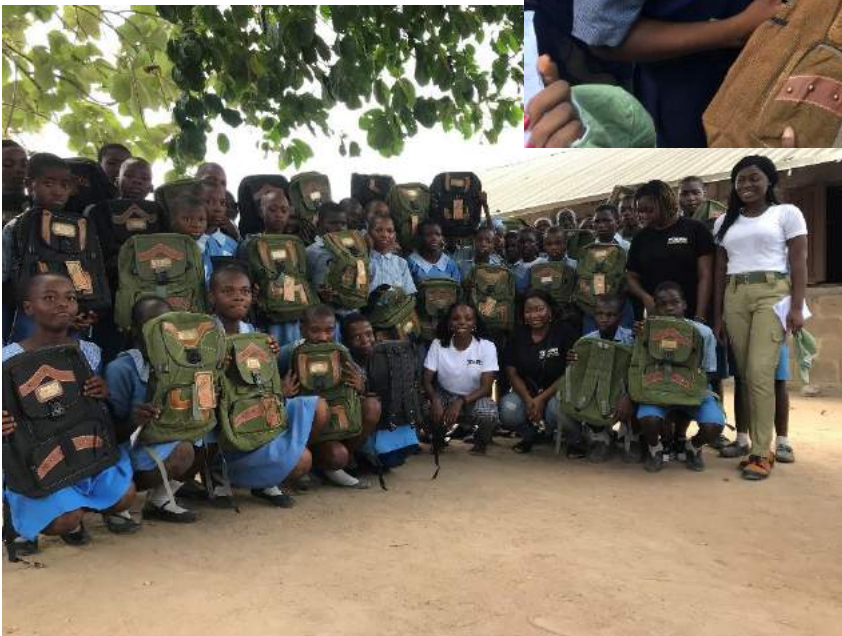
8 May 2019: with the recipients of school bags and supplies at the Oduduwa Junior Secondary School, Mushin