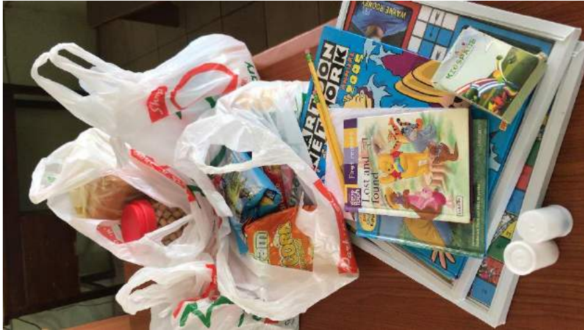
Snacks, reading materials and board games during a visit to the special correctional center, Oregon